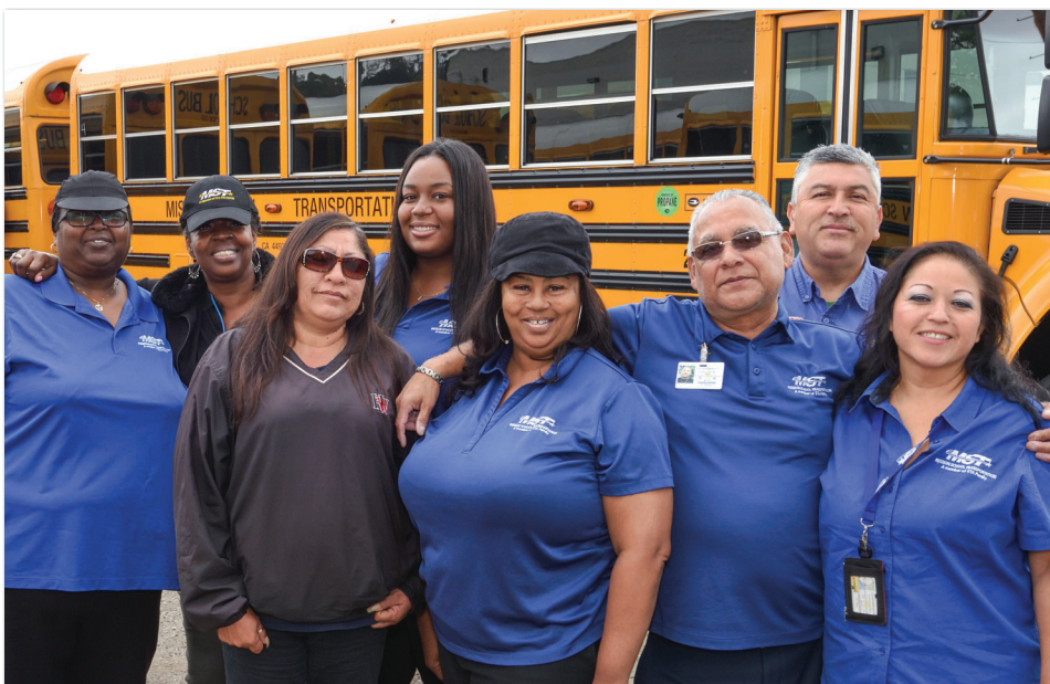
Mission School Transportation Local 572 members