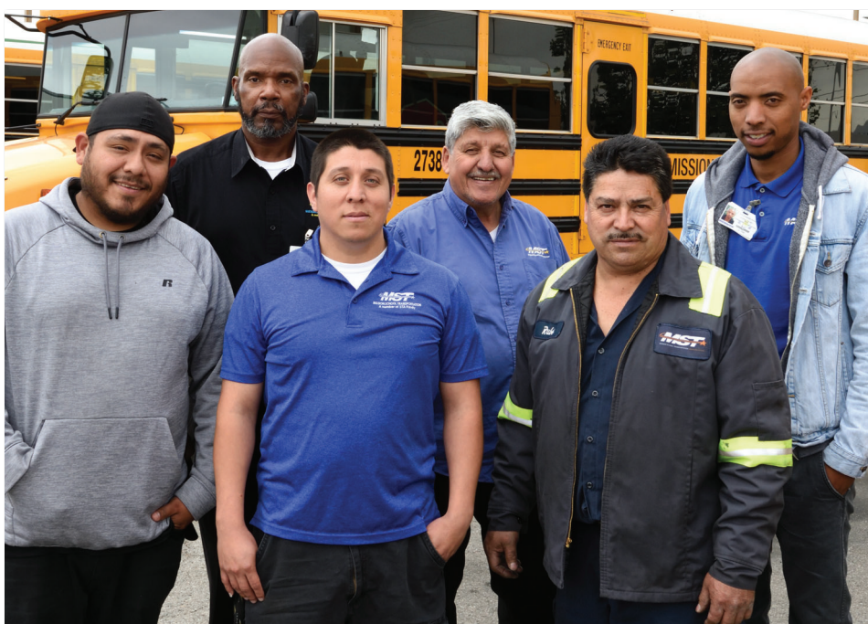
Mission School Transportation Local 572 members