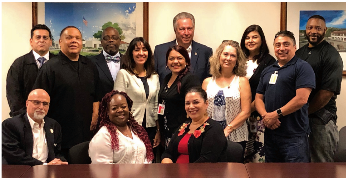
LAUSD NEGOTIATING COMMITTEE